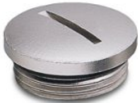
Filler plugs, for Pg screw connections, type Pg11

Please be informed that the data shown in this PDF Document is generated from our Online Catalog. Please find the complete data in the user's documentation. Our General Terms of Use for Downloads are valid ( http://phoenixcontact.com/download )