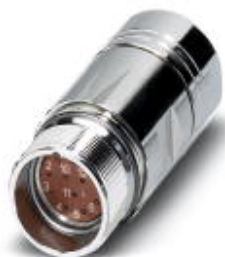
Coupler connector, straight, Screw locking, M23, number of positions: 16, type of contact: Socket, Crimp connection, shielded: yes, cable diameter range: 6 mm ... 10 mm

Please be informed that the data shown in this PDF Document is generated from our Online Catalog. Please find the complete data in the user's documentation. Our General Terms of Use for Downloads are valid ( http://phoenixcontact.com/download )