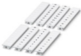
Zack marker strip, 10-section, horizontally labeled with the consecutive numbers: 21 ... 30, white, width: 5 mm

Please be informed that the data shown in this PDF Document is generated from our Online Catalog. Please find the complete data in the user's documentation. Our General Terms of Use for Downloads are valid ( http://phoenixcontact.com/download )