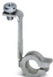
PE contact for UM-PRO panel mounting base for connecting the PCB to the DIN rail at level 3

Please be informed that the data shown in this PDF Document is generated from our Online Catalog. Please find the complete data in the user's documentation. Our General Terms of Use for Downloads are valid ( http://phoenixcontact.com/download )