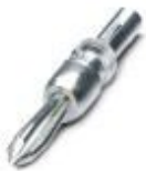
Test plugs, with solder connection up to 1 mm 2 conductor cross section, color: gray