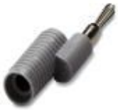
Reducing plug, color: gray