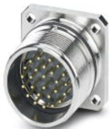
Contact carriers, M27, number of positions: 26, type of contact: Pin, Solder-in connection

Please be informed that the data shown in this PDF Document is generated from our Online Catalog. Please find the complete data in the user's documentation. Our General Terms of Use for Downloads are valid ( http://phoenixcontact.com/download )