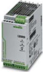
Primary-switched QUINT POWER power supply for DIN rail mounting with SFB (Selective Fuse Breaking) Technology, with protective coating, input: 3-phase, output: 24 V DC/20 A

Please be informed that the data shown in this PDF Document is generated from our Online Catalog. Please find the complete data in the user's documentation. Our General Terms of Use for Downloads are valid ( http://phoenixcontact.com/download )