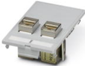
Front plate with contact inserts, plastic with shroud, 2x RJ socket/socket

Please be informed that the data shown in this PDF Document is generated from our Online Catalog. Please find the complete data in the user's documentation. Our General Terms of Use for Downloads are valid ( http://phoenixcontact.com/download )