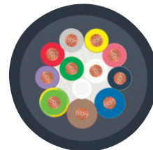
Cable cross section