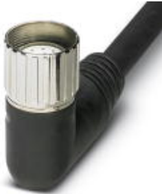
M23 socket, angled, 12-pos., with 5 m master cable, pin 9 and 10 bridged

Please be informed that the data shown in this PDF Document is generated from our Online Catalog. Please find the complete data in the user's documentation. Our General Terms of Use for Downloads are valid ( http://phoenixcontact.com/download )