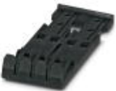
Strain relief, Number of positions: 4, Color: black