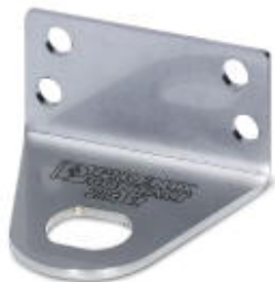
Angled bracket for individually fixing CN-UB... to housing panels, for example.

Please be informed that the data shown in this PDF Document is generated from our Online Catalog. Please find the complete data in the user's documentation. Our General Terms of Use for Downloads are valid ( http://phoenixcontact.com/download )