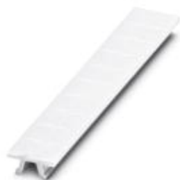
Zack marker strip, 10-section, horizontally labeled with the consecutive numbers: 401 ... 410, white, width: 6 mm

Please be informed that the data shown in this PDF Document is generated from our Online Catalog. Please find the complete data in the user's documentation. Our General Terms of Use for Downloads are valid ( http://phoenixcontact.com/download )