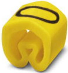
Conductor marking collar, Labeled with the number: Numbers, yellow, width: 3.2 mm

Please be informed that the data shown in this PDF Document is generated from our Online Catalog. Please find the complete data in the user's documentation. Our General Terms of Use for Downloads are valid ( http://phoenixcontact.com/download )