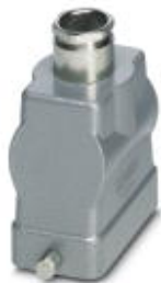
HEAVYCON sleeve housing B10, for single locking latch, height 72 mm, with screw connection 1x M25, straight conductor exit

Please be informed that the data shown in this PDF Document is generated from our Online Catalog. Please find the complete data in the user's documentation. Our General Terms of Use for Downloads are valid ( http://phoenixcontact.com/download )