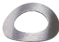
Spring Washer x24