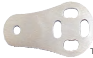
Terminal Bars x2