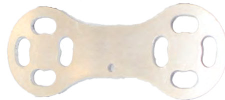
Bus Bar x6