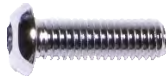
6mm Cap Screws x24