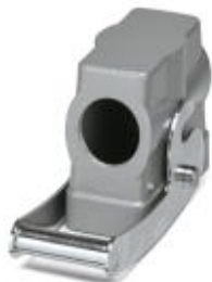
HEAVYCON B16 sleeve housing, with central locking latch, height: 56 mm, with 1 x M32 thread, lateral cable outlet

Please be informed that the data shown in this PDF Document is generated from our Online Catalog. Please find the complete data in the user's documentation. Our General Terms of Use for Downloads are valid ( http://phoenixcontact.com/download )