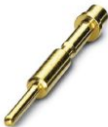
Crimp contact, turned, Single contact, contact diameter: 1 mm, crimp range: 0.5 mm 2 ... 1.5 mm 2

Please be informed that the data shown in this PDF Document is generated from our Online Catalog. Please find the complete data in the user's documentation. Our General Terms of Use for Downloads are valid ( http://phoenixcontact.com/download )