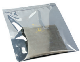
3M™ Metal-Out Static Shielding Bag 2100R/2110R

The bags are tested to meet or exceed certain electrical and physical requirements of ANSI/ESD S541 and to be ANSI/ESD S20.20 program compliant. Bags are RoHS Compliant* and lead-free**.