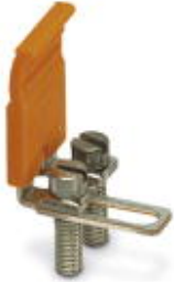
Switching jumper, Number of positions: 2, Color: silver

Please be informed that the data shown in this PDF Document is generated from our Online Catalog. Please find the complete data in the user's documentation. Our General Terms of Use for Downloads are valid ( http://phoenixcontact.com/download )