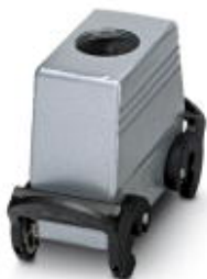
HEAVYCON sleeve housing B16, with double locking latch, height 76 mm, without support 1x M40, lateral conductor exit

Please be informed that the data shown in this PDF Document is generated from our Online Catalog. Please find the complete data in the user's documentation. Our General Terms of Use for Downloads are valid ( http://phoenixcontact.com/download )