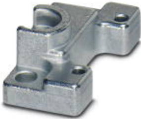
Panel mounting flange for HEAVYCON-ADVANCE TMS housing with screw locking

Please be informed that the data shown in this PDF Document is generated from our Online Catalog. Please find the complete data in the user's documentation. Our General Terms of Use for Downloads are valid ( http://phoenixcontact.com/download )