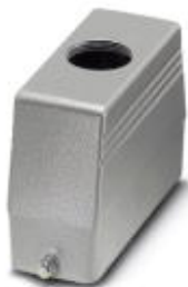
HEAVYCON sleeve housing B24, for single locking latch, height 76 mm, without support 1x M25, straight conductor exit

Please be informed that the data shown in this PDF Document is generated from our Online Catalog. Please find the complete data in the user's documentation. Our General Terms of Use for Downloads are valid ( http://phoenixcontact.com/download )