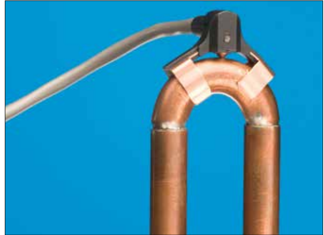
Sens-A-Coil Thermistor Sensor

Standard resistance tolerance is \pm 2\% at 25°C. Resistance versus temperature information for material curve Z can be found on page 59.