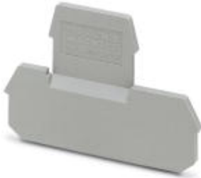
End cover, Length: 62 mm, Width: 2.5 mm, Color: gray

Please be informed that the data shown in this PDF Document is generated from our Online Catalog. Please find the complete data in the user's documentation. Our General Terms of Use for Downloads are valid ( http://phoenixcontact.com/download )