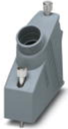
Plastic sleeve housing, locking screws with knurled head, type 3, cable screw connection Pg21

Please be informed that the data shown in this PDF Document is generated from our Online Catalog. Please find the complete data in the user's documentation. Our General Terms of Use for Downloads are valid ( http://phoenixcontact.com/download )