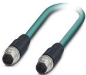
Assembled Ethernet cable, shielded, 4-pair, 26 AWG stranded (7-wire), RAL 5021 (water blue), M12 plug to M12 plug, line, length: 26 m

Please be informed that the data shown in this PDF Document is generated from our Online Catalog. Please find the complete data in the user's documentation. Our General Terms of Use for Downloads are valid ( http://phoenixcontact.com/download )