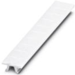
Zack marker strip, horizontally labeled with the capital letter: L, white, width: 6 mm

Please be informed that the data shown in this PDF Document is generated from our Online Catalog. Please find the complete data in the user's documentation. Our General Terms of Use for Downloads are valid ( http://phoenixcontact.com/download )