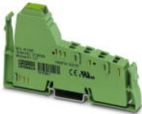
Terminal with two analog inputs

Please be informed that the data shown in this PDF Document is generated from our Online Catalog. Please find the complete data in the user's documentation. Our General Terms of Use for Downloads are valid ( http://phoenixcontact.com/download )