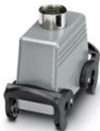
HEAVYCON sleeve housing B16, with double locking latch, height 65 mm, with support 1x M25, straight conductor exit

Please be informed that the data shown in this PDF Document is generated from our Online Catalog. Please find the complete data in the user's documentation. Our General Terms of Use for Downloads are valid ( http://phoenixcontact.com/download )