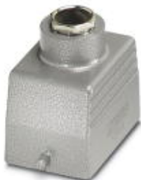
Sleeve housing, for single locking latch, height 40 mm, with screw connection, 1x Pg13.5, straight cable entry

Please be informed that the data shown in this PDF Document is generated from our Online Catalog. Please find the complete data in the user's documentation. Our General Terms of Use for Downloads are valid ( http://phoenixcontact.com/download )