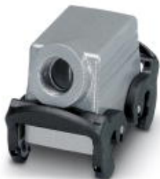
HEAVYCON sleeve housing B10, with double locking latch, height 52 mm, with support 1x M20, lateral conductor exit

Please be informed that the data shown in this PDF Document is generated from our Online Catalog. Please find the complete data in the user's documentation. Our General Terms of Use for Downloads are valid ( http://phoenixcontact.com/download )