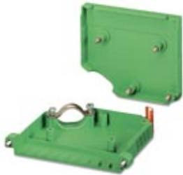
Cable housing, Pitch: 0 mm, Number of positions: 9, Dimension a: 70.98 mm, Color: green

Please be informed that the data shown in this PDF Document is generated from our Online Catalog. Please find the complete data in the user's documentation. Our General Terms of Use for Downloads are valid ( http://phoenixcontact.com/download )