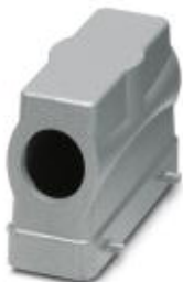
HEAVYCON B24 sleeve housing, for double locking latch, height: 76 mm, with 1 x M32 thread, lateral cable outlet

Please be informed that the data shown in this PDF Document is generated from our Online Catalog. Please find the complete data in the user's documentation. Our General Terms of Use for Downloads are valid ( http://phoenixcontact.com/download )