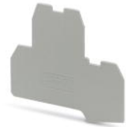
End cover, Length: 77.5 mm, Width: 1.5 mm, Height: 73 mm, Color: gray

Please be informed that the data shown in this PDF Document is generated from our Online Catalog. Please find the complete data in the user's documentation. Our General Terms of Use for Downloads are valid ( http://phoenixcontact.com/download )