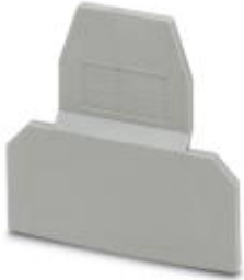
End cover, Length: 56 mm, Width: 2.2 mm, Height: 52 mm, Color: gray

Please be informed that the data shown in this PDF Document is generated from our Online Catalog. Please find the complete data in the user's documentation. Our General Terms of Use for Downloads are valid ( http://phoenixcontact.com/download )