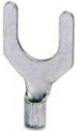
Fork-type cable lug, non-insulated, 2.6 - 6 mm 2 , M6

Please be informed that the data shown in this PDF Document is generated from our Online Catalog. Please find the complete data in the user's documentation. Our General Terms of Use for Downloads are valid ( http://phoenixcontact.com/download )