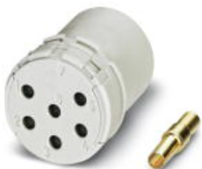
Contact insert, number of positions: 8+1, type of contact: Socket, Crimp connection

Please be informed that the data shown in this PDF Document is generated from our Online Catalog. Please find the complete data in the user's documentation. Our General Terms of Use for Downloads are valid ( http://phoenixcontact.com/download )