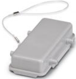
HEAVYCON protective cover, series B16, for supporting base element with double locking latch, with retaining cord, IP54, PA

Please be informed that the data shown in this PDF Document is generated from our Online Catalog. Please find the complete data in the user's documentation. Our General Terms of Use for Downloads are valid ( http://phoenixcontact.com/download )