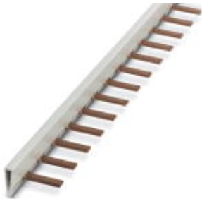
Insertion bridge, Number of positions: 56, Color: gray

Please be informed that the data shown in this PDF Document is generated from our Online Catalog. Please find the complete data in the user's documentation. Our General Terms of Use for Downloads are valid ( http://phoenixcontact.com/download )