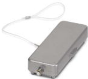
HEAVYCON protective cover, type B16, for supporting base element with single locking latch, with retaining cord, IP65, ALU

Please be informed that the data shown in this PDF Document is generated from our Online Catalog. Please find the complete data in the user's documentation. Our General Terms of Use for Downloads are valid ( http://phoenixcontact.com/download )