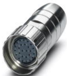
Cable connector, straight, Screw locking, M27, number of positions: 26, type of contact: Socket, Solder connection

Please be informed that the data shown in this PDF Document is generated from our Online Catalog. Please find the complete data in the user's documentation. Our General Terms of Use for Downloads are valid ( http://phoenixcontact.com/download )