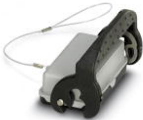
HEAVYCON protective cover, type B10, for sleeve housing without single locking latch, with retaining cord, IP54

Please be informed that the data shown in this PDF Document is generated from our Online Catalog. Please find the complete data in the user's documentation. Our General Terms of Use for Downloads are valid ( http://phoenixcontact.com/download )