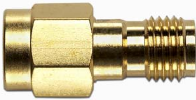
Model 72967 SMA JACK (F) / JACK (F), REVERSE POLARITY

High bandwidth, small size, and durability for confident connections