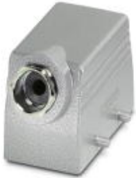
Sleeve housing, for double locking latch, height 52 mm, with screw connection, 1x M20, lateral cable outlet

Please be informed that the data shown in this PDF Document is generated from our Online Catalog. Please find the complete data in the user's documentation. Our General Terms of Use for Downloads are valid ( http://phoenixcontact.com/download )