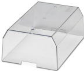
Cover, for the contact- and dust-protected encapsulation of the components

Please be informed that the data shown in this PDF Document is generated from our Online Catalog. Please find the complete data in the user's documentation. Our General Terms of Use for Downloads are valid ( http://phoenixcontact.com/download )