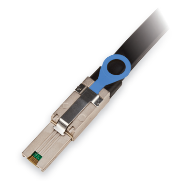
3M<sup>™</sup> High Routability External MiniSAS Cable Assembly