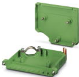
Cable housing, pitch: 0 mm, number of positions: 8, dimension a: 62.76 mm, color: green

Please be informed that the data shown in this PDF Document is generated from our Online Catalog. Please find the complete data in the user's documentation. Our General Terms of Use for Downloads are valid ( http://phoenixcontact.com/download )