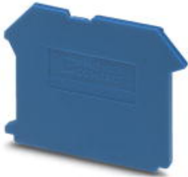
End cover, Length: 50.5 mm, Width: 2 mm, Height: 47 mm, Color: blue

Please be informed that the data shown in this PDF Document is generated from our Online Catalog. Please find the complete data in the user's documentation. Our General Terms of Use for Downloads are valid ( http://phoenixcontact.com/download )