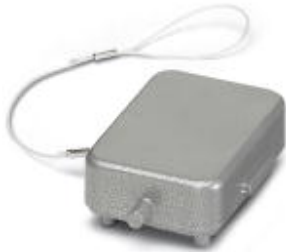
HEAVYCON protective cover, type B6, for supporting base element with single locking latch, with retaining cord, IP65, ALU

Please be informed that the data shown in this PDF Document is generated from our Online Catalog. Please find the complete data in the user's documentation. Our General Terms of Use for Downloads are valid ( http://phoenixcontact.com/download )