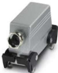
Sleeve housing, with double locking latch, height 76 mm, with screw connection, 1x Pg21, lateral cable entry

Please be informed that the data shown in this PDF Document is generated from our Online Catalog. Please find the complete data in the user's documentation. Our General Terms of Use for Downloads are valid ( http://phoenixcontact.com/download )